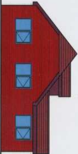
REAR GABLE ELEVATION.